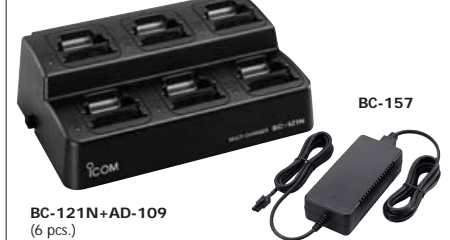
BC-121N+AD-109 (6 pcs.)